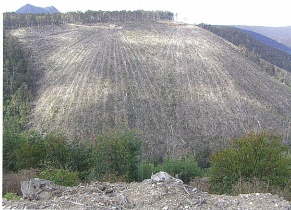
Above: South Esk catchment: this steep terrain was cable logged of all vegetation and is now used for plantation forestry - runoff from chemicals will enter the water supply.