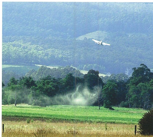
Below: Agricultural spraying near water

For more information contact: Pollution Information Tasmania Web: PollutionInformationTas.org.au Email: info@pollutioninformationtas.org.au