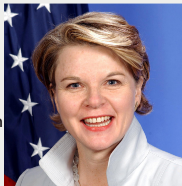
Margaret Spellings Member, Fix the Debt Steering Committee

Ballard Spahr Special Counsel, lobbied on Medicare reimbursements Greenhill & Co. Senior Advisor