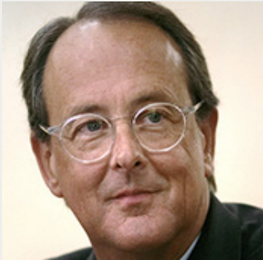
Erskine Bowles Co-founder, Fix the Debt