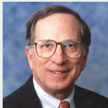
Sam Nunn Member, Fix the Debt Steering Committee

Morgan Stanley Board: $345,000 Facebook Board: $618,067 Norfolk Southern Board: $285,840